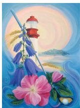
Village de Métis-sur-Mer