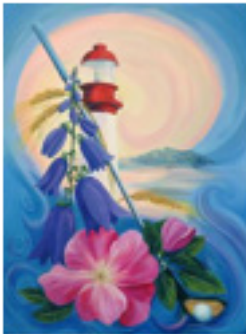
Ville de Métis-sur-Mer

Volunteers needed (various roles and responsibilities required: small, medium and large!) Please contact Martine on 418-936-3373