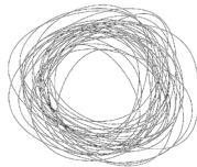
café sur mer

Café sur mer will open 7 days a week for the summer months, starting June 22 nd