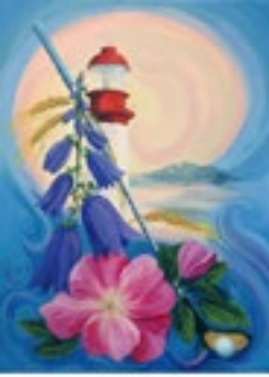
Ville de Métis-sur-Mer