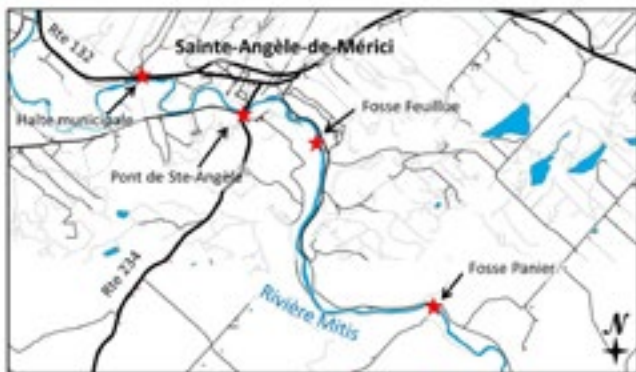
Figure 2 Sainte-Angèle-de-Méridi et la rivière Mitis